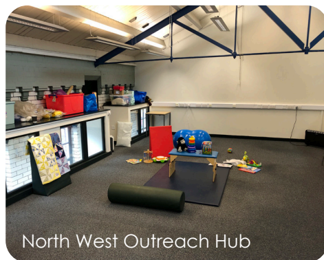
North West Outreach Hub