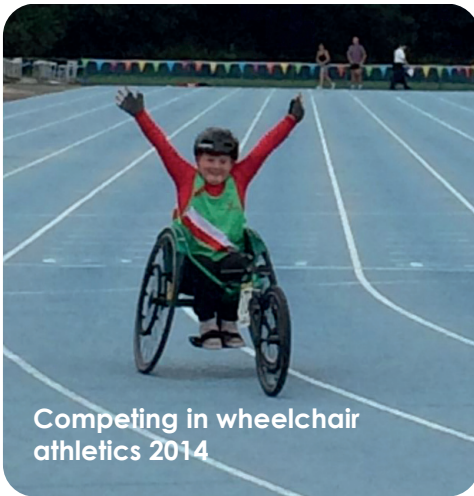
Competing in wheelchair athletics 2014